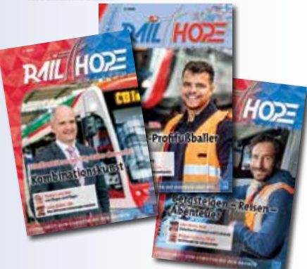
▲ Three RailHope Magazine editions '22

experience will encourage other RailHope associations to work even more closely together.