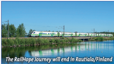
The RailHope Journey will end in Rautiala/Finland