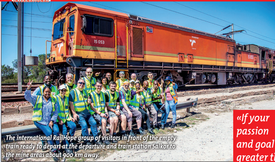
The international RailHOPE group of visitors in front of the empty train ready to depart at the departure and train station Salkor to the mine areas about 900 km away.